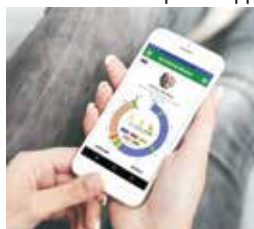
ADLcare™ smartphone app

Activity is the hallmark of wellness: the better we feel, the more we do. When someone doesn't feel well or begins to lose function, their activity starts to decline. Change in activity is a powerful metric for understanding a person's well-being and their ability to care for themselves. Activities of Daily Living (ADLs) are the critical activities needed for self-care and are used to assess a person's level of independence. ADLcare continuously measures the basic ADLs: walking, sitting, lying down, and light activity.